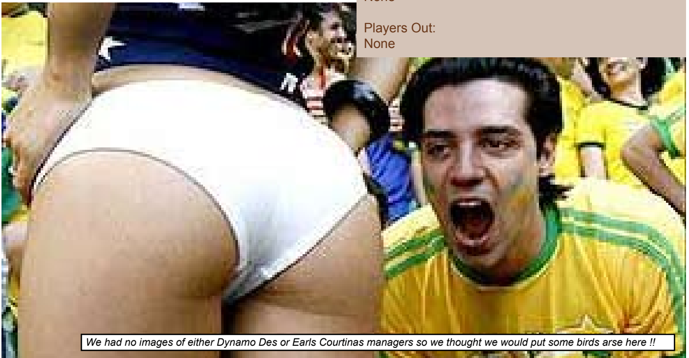
We had no images of either Dynamo Des or Earls Courtinas managers so we thought we would put some birds arse here !!